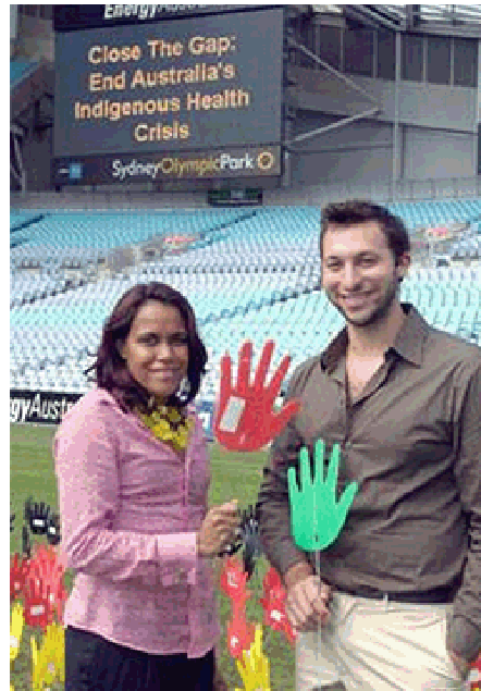
Figure 7: Close the Gap Campaign patrons, Olympians Catherine Freeman and Ian Thorpe at the Campaign launch in April 2007.

Beyond official partners, the Campaign has the pledged support of over 140 000 Australians to 'Close the Gap', and this wide community support is evidenced by the 570 community events that marked national Close the Gap Day on 25 March 2010. In August 2009, the National Rugby League became the first sporting code to join the Campaign, dedicating an annual round of matches to Close the Gap.