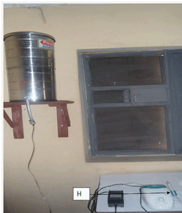
Figure 2: The improvised source of water coolant connected to ultrasonic scaler (H).