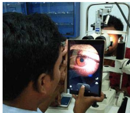
Figure 4: Capturing images from the slit lamp using the eyeSmart app on the tablet.