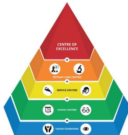
Figure 1: Pyramidal model of eye care at LV Prasad Eye Institute.

The prevalence of demographic details and clinical presentations were captured. No identifiable information of the patient was used for analytical purposes. The de-identified information was replicated into another database from where analytics were visualized using tools for the same in real time. eyeSmart EMR is an indigenously built electronic medical record system at the LV Prasad Eye Institute, India. This system was developed in-house by using open source tools such as PHP (Zend Technologies; http://www.php.net ) for programming and MySQL (Oracle Corporation; http://www.mysql.com ) for database management. The eyeSmart App was developed on the Android platform and is operational in the rural vision centers in the LVPEI network.