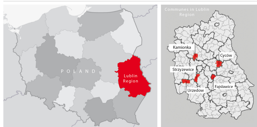
Figure 1: Patients and healthy study participants recruitment: map of Lublin region and five rural communes.

Statistical power, calculated for measured values (area of land in hectares) and sample sizes (number of individuals in each of the two groups), was calculated as 99.9% ( p < 0.05 level). The DSS Statistical Power Calculator was used (two-tailed test) (DSS Research; http://www.dssresearch.com/KnowledgeCenter/toolkitcalculators.aspx ).