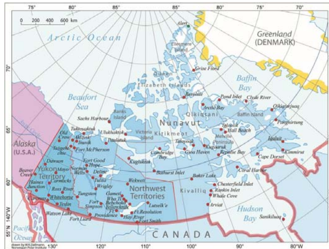
Figure 1: Map of Canada's three northern territories.